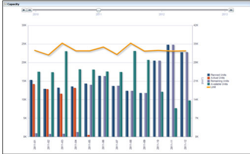
Figure 4. Resource capacity and utilization reports help you quickly identify over- and under-allocated resources.