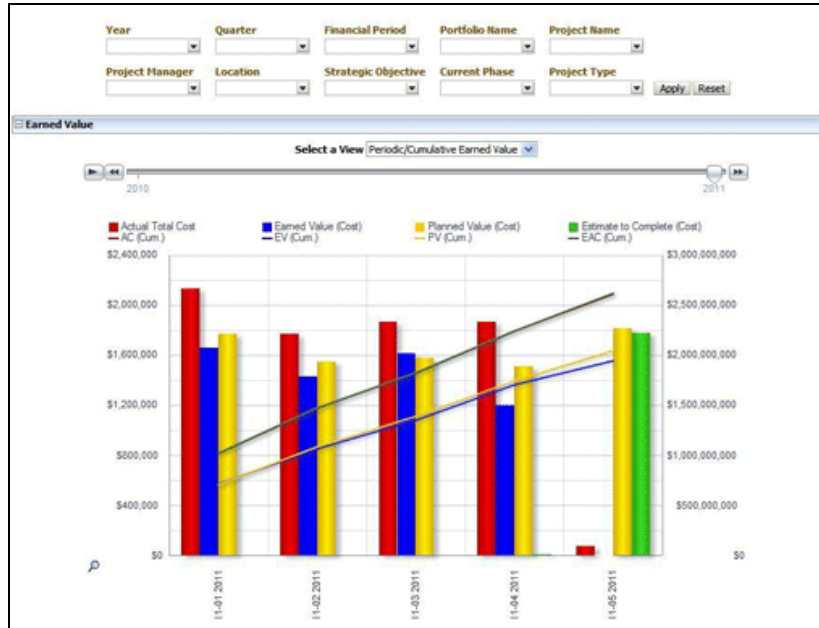
Figure 2. Earned value reports are automatically generated based on your dashboard filters.